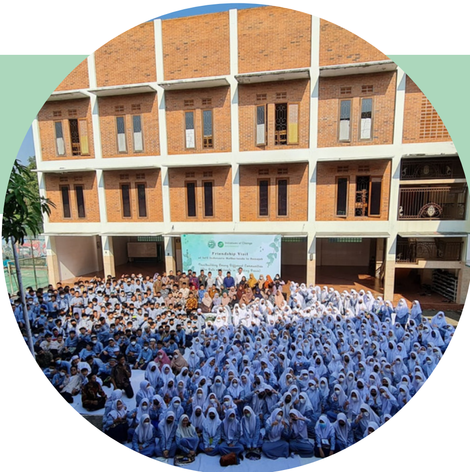
Students of Madrasah Tsanawiyah An-Najah, Bogor