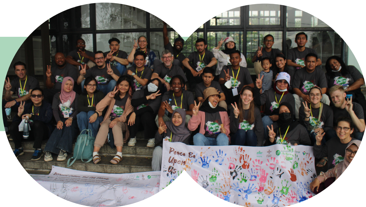
International Diversity Camp Participants after campaigning peace at Asia Afrika street in Bandung.