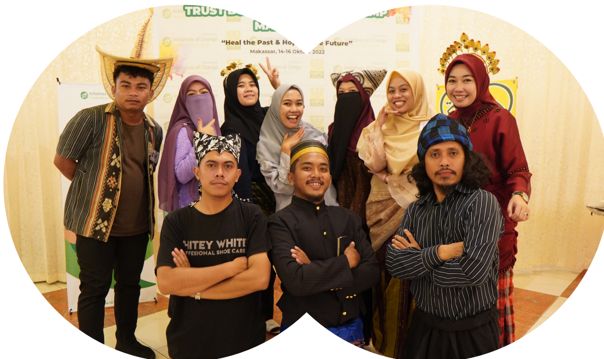
Mentors & participants of Trustbuilding Program Makassar wear traditional costume from their own culture

TrustBuilding Camp held in October 2022 by inviting 50 young people from Makassar and its surroundings to gather, practice and learn and explore their potential, strengthen the moral values of life, increase their capacity as young people who are tough and ready to face global challenges, and ignite the spirit of peace!